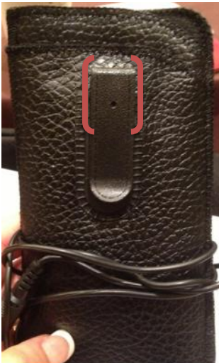
A wired eye glass holder with camera