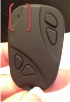
A wireless remote-control with camera