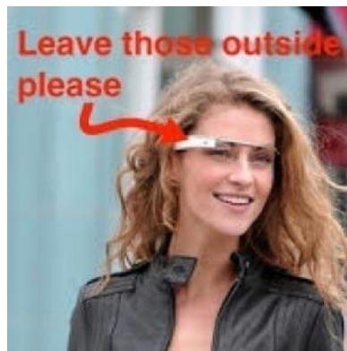
Google glasses with camera