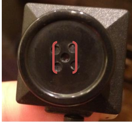
A wired shirt button with camera