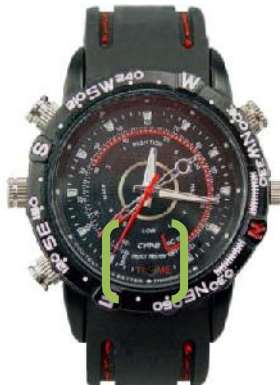
Wrist watch with wireless camera